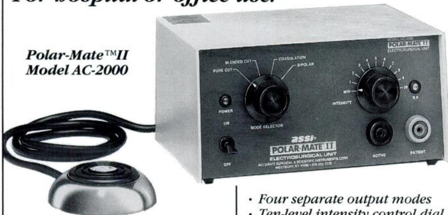
Polar-Mate™II Model AC-2000

High performance electrosurgical generator with four separate output modes: Pure-cut, Blended-cut, Coagulation and Bipolar functions.